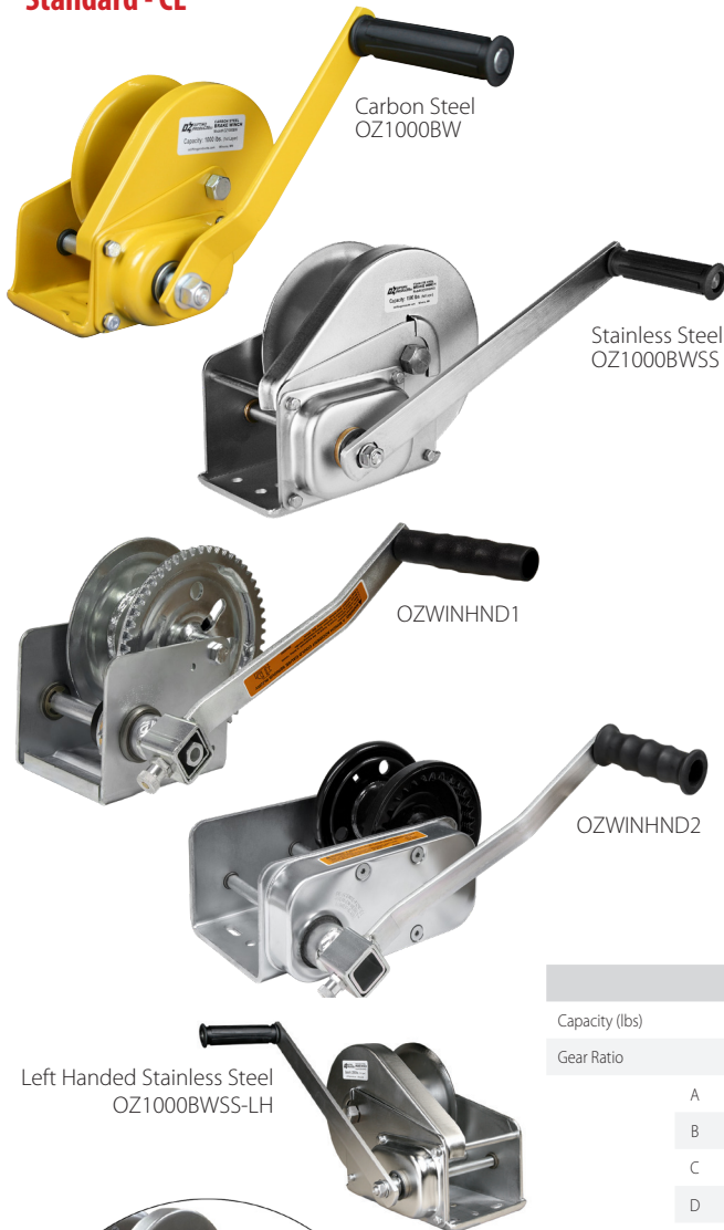
Left Handed Stainless Steel OZ1000BWSS-LH