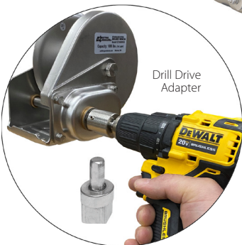
Drill Drive Adapter